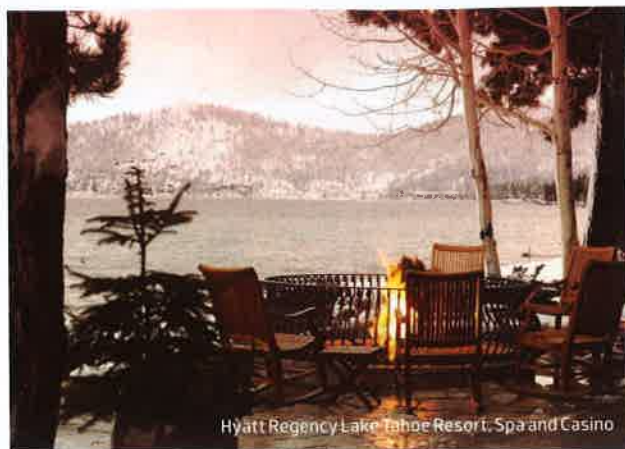
Hyatt Regency Lake Tahoe Resort, Spa and Casino

Other hotels that have undergone renovations include Timber Cove Lodge, which has become Beach Retreat & Lodge at Tahoe ( tahoebeachretreat.com ); Tahoe Beach & Ski Club ( tahoebeachandski.com ), in its