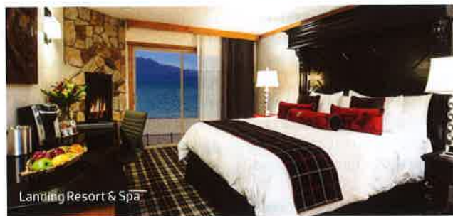
Landing Resort & Spa